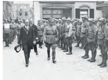
Mayor Ficq inspects the troops on the Hoofdwagt in 1938.