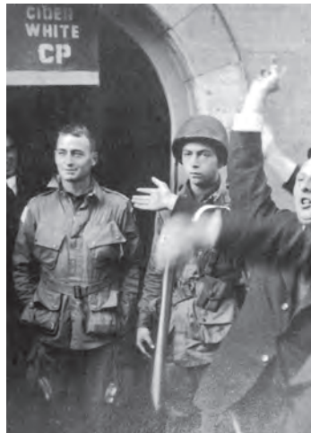
On 18 September 1944, the command post Cider White was established.